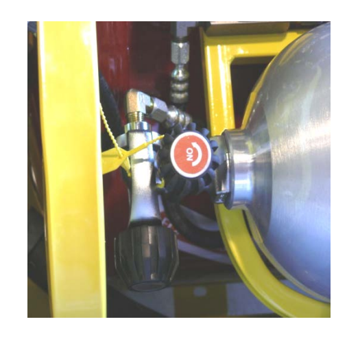
Air Cylinder Valve