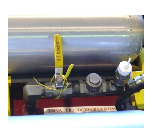
Water/Chemical Fill Valve