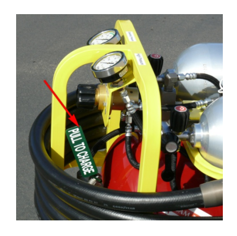
Foam Charge/"Pull to Charge" Valve